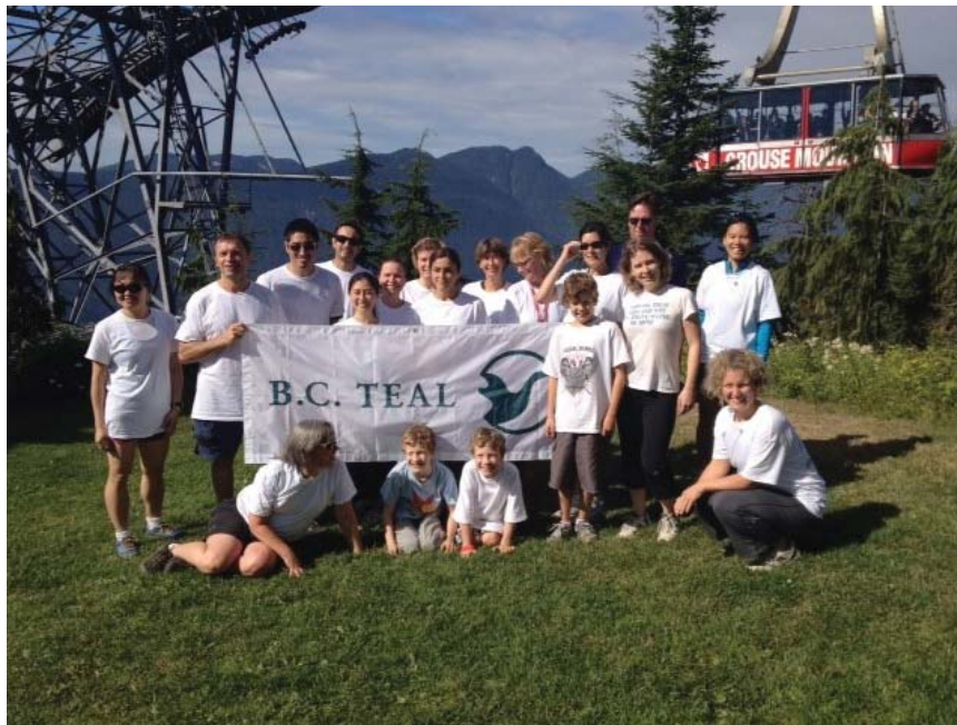
The First TCF Climb for the Cause—Grouse Grind

The members of BC TEAL established the TEAL Charitable Foundation in 1986 as a registered charitable foundation with Revenue Canada in order to financially support English language educators and learners. The following TCF awards are currently available to English language educators and learners.