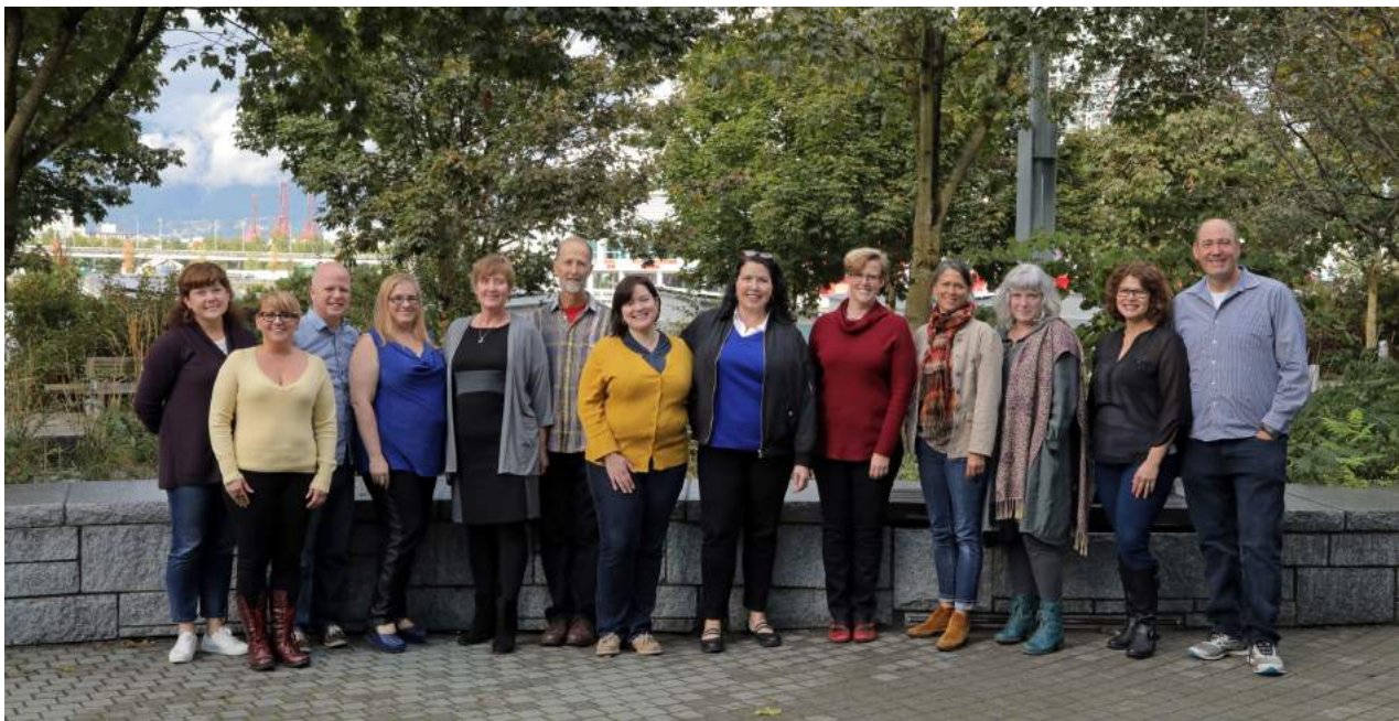
the BC TEAL Board of Directors at their September retreat in Vancouver

We value your insights and skills, and look forward to learning and growing with you. Should you at some point want to join