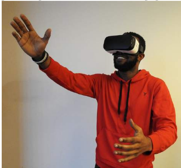
reaching out with technology

destinations such as a famous museum, an ancient library or historical ruins. The possibilities are endless. Some teachers might even take their students on an expedition to far away planets in space or to explore the wondrous world of the Atlantic Ocean. Google Expeditions works the following way: once the instructor sets the location, students can tag along and follow their instructor on a virtually guided tour as a group. Instructors also have the option of adding questions or prompts in their language of choice within the tour that students can answer or follow respectively. For example, a language instructor can conduct an entire tour in the target language by devising clues and questions in the language of their choice. Students are thus engaged in a virtual experience within their language of study.