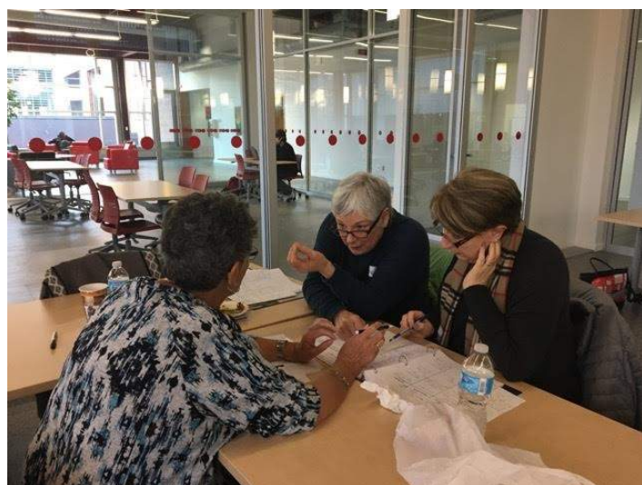
tutors working together

Initially, the tutoring program was intended to break through some barriers so the young women could learn some basic language skills, but what we are actually seeing is that there are other benefits well beyond that. Many of the young women are certainly becoming more confident with their language skills and are curious to explore what is available to them and their families within their new community. They are trying new activities and finding new interests that they didn't know existed. For example, one of our TALK tutor students has faced a life-long fear and is now learning to swim at the community centre, and others have explored music lessons and sports programs for their family.