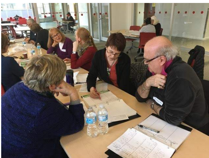
tutors working together